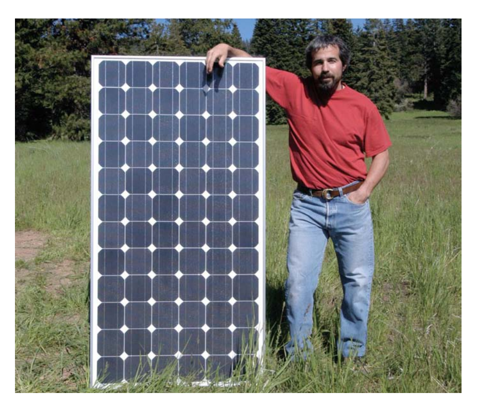
A Sharp 175-watt solar-electric module, 62 x 32.5 inches. The author, 66.25 x 18.5 inches.