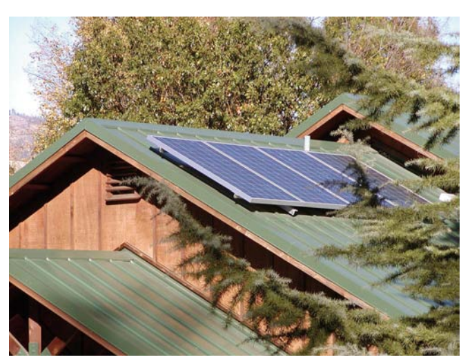
Even a small system can reduce your utility bills while producing clean energy.

Whether to install your solar-electric system yourself or hire a professional is a decision not to be taken lightly. Doing it