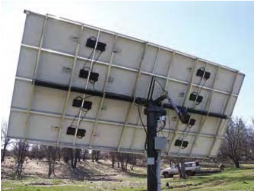
Precision —this large Wattsun tracker moves east to west with a top-of-pole gear; north-south adjustment is powered by a screw-drive actuator arm.

A third potential advantage of this type of tracker is shipping and installation. Since the tracker doesn't have to be assembled at the factory, it can be shipped in a number of boxes, reducing shipping expense and handling difficulties. The tracker can be assembled piece by piece on its mount; this is far easier than trying to hoist a heavy preassembled tracker onto its mounting pole.