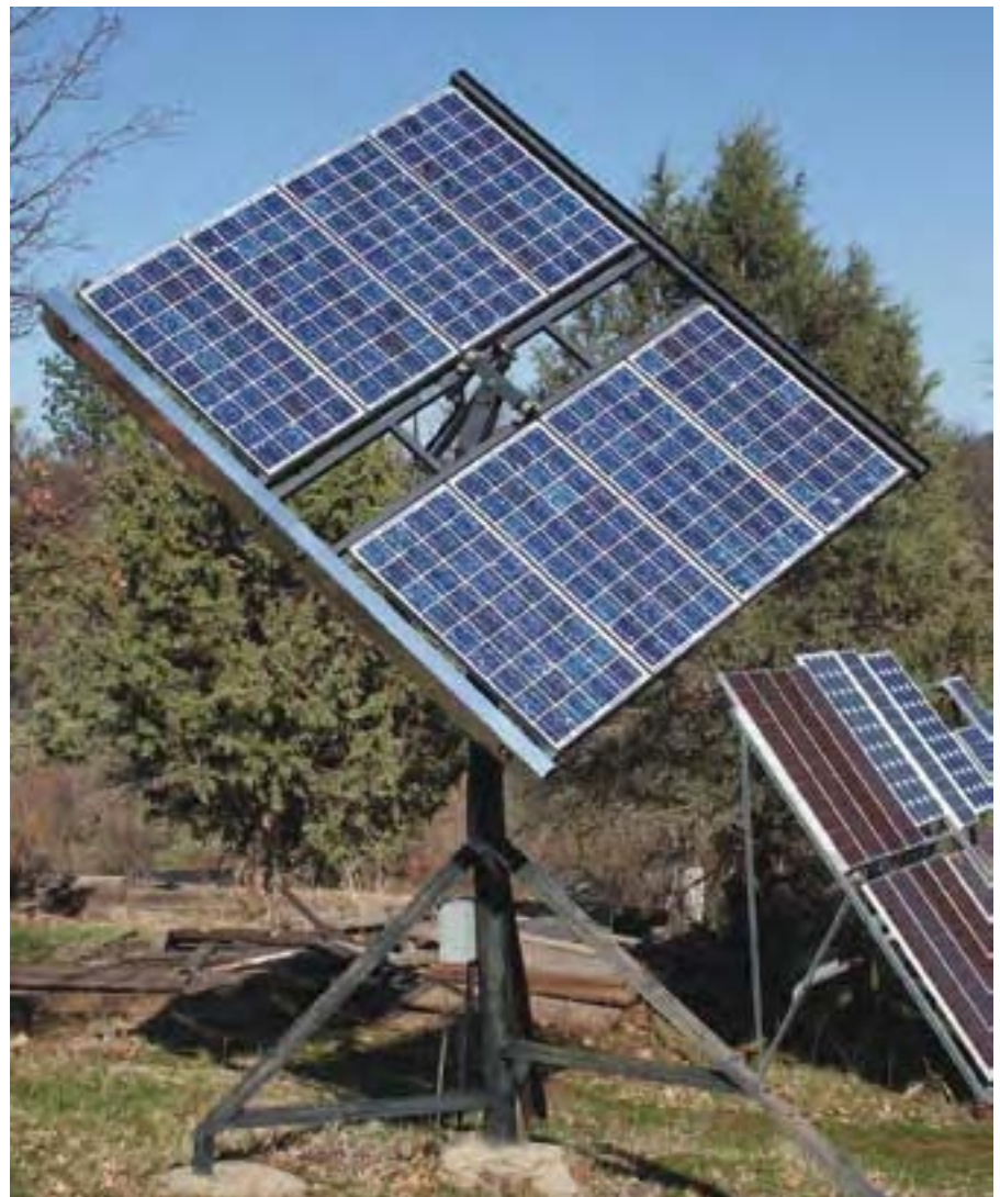
Freon in the two side tubes allows this Zomeworks thermal tracker to follow the sun. The braced pole supports were custom-made to aid installation in rocky ground.

A second advantage of electrically operated trackers is that they ignore temperature, since they are powered by electricity, not the sun's heat. This makes this type of tracker more accurate in climates with cold winters.