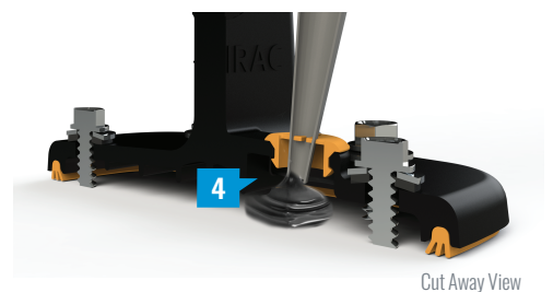
Cut Away View

With an outer shield 1 contour-conforming gasket 2 and pressurized sealant chamber 3 the Triple Seal technology delivers a 100% waterproof connection.