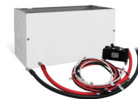
XW+ Installation Kit for INV 2 INV 3 PDP