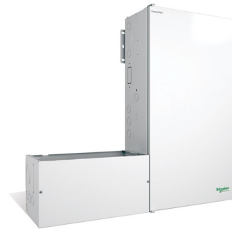
XW+ Power Distribution Panel