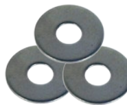
3/8" SS Flat Washers