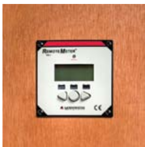
In Wall Mount