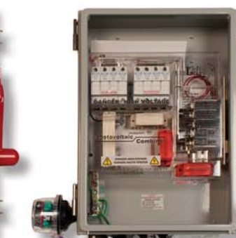
MNPVHV8 3R not shown