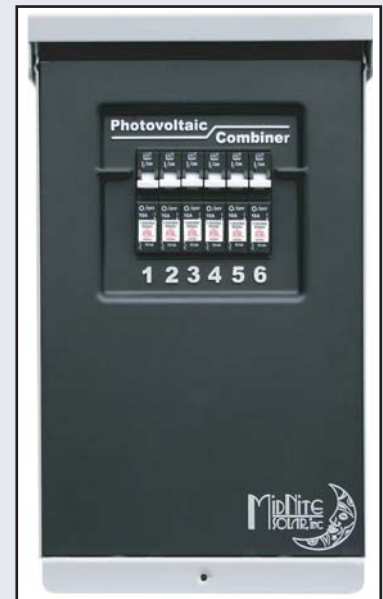
Configured for 150VDC Breakers (Offgrid)