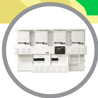
Magnum Energy MPDH Panel and four MS-PAE Inverter/Chargers