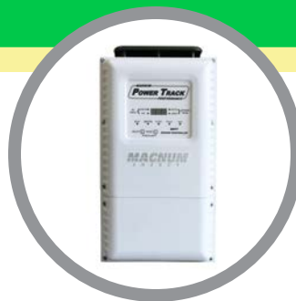
Up to seven (7) PT-100 Charge Controllers for 42kW output at 48V