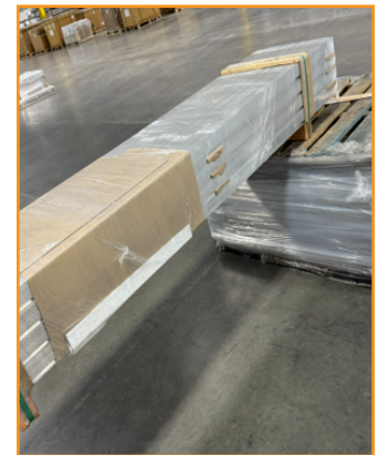
Rails stored inside warehouse.