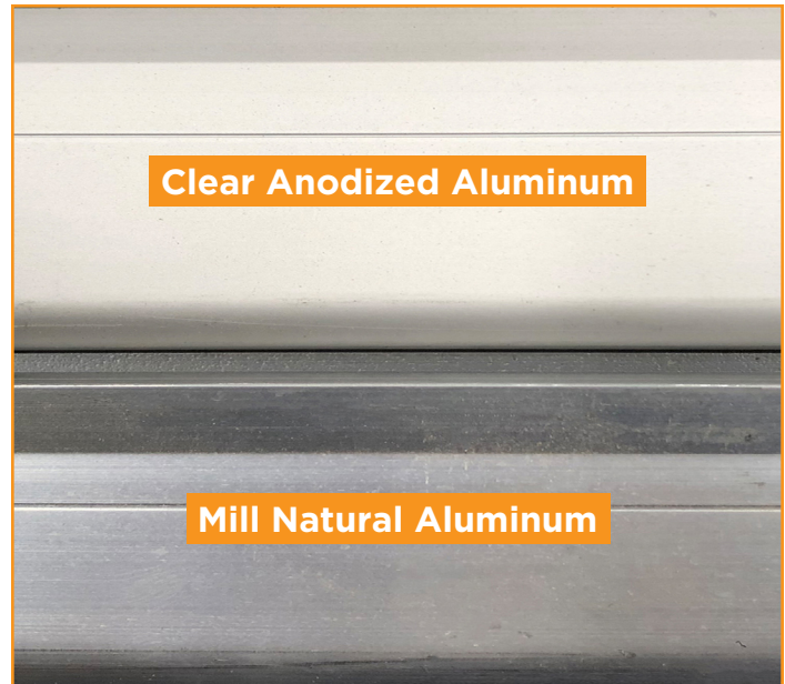
Examples of different surfaces in rails used for solar module mounting.