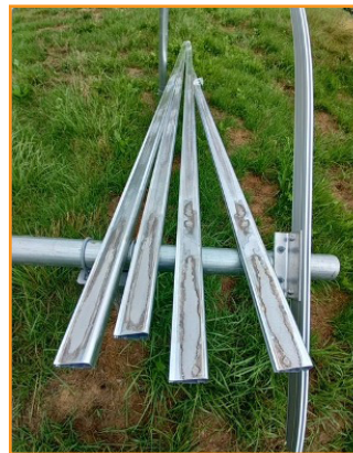
Visible stains on mill rails.