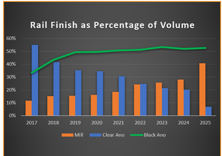
Chart comparing mill vs. anodized rail volumes over time.

As the solar industry scaled, more solar organizations became comfortable with the finish and performance limitations inherent in unfinished, bare aluminum. An inflection point was reached where the de facto choice for rail finish went from anodized (or clear) rail, to unfinished, mill rail. The demand for black rail finish, however, has remained consistent over time.