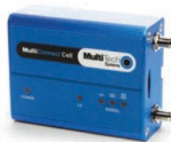
CELLMODEM-01 / -03

Enphase Consumption CT , split-core current transformer, accuracy +/- 2.5% for monitoring whole-home energy consumption. Compatible with IQ Envoy and IQ Combiner.