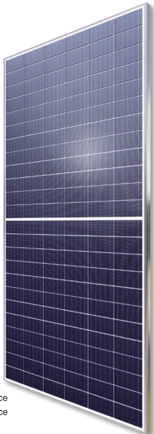
Fig. similar 144MHUSA200415A

High quality junction box and connector system for a longer life time