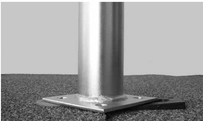
In combination, shims (1/16" and tapered) level standoff.