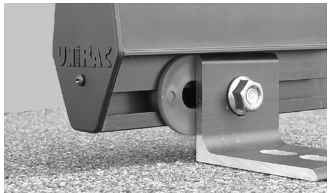
Shim (1/8") used for precise alignment of SunFrame rail. For purposes of illustration, the shim is to the left of its final position around the bolt shaft.