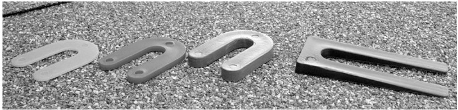
Part no. 990105 1 1/2" x 2" x 1/16" (blue)

Shims are structural elements. Photographs below illustrate examples of correct use.